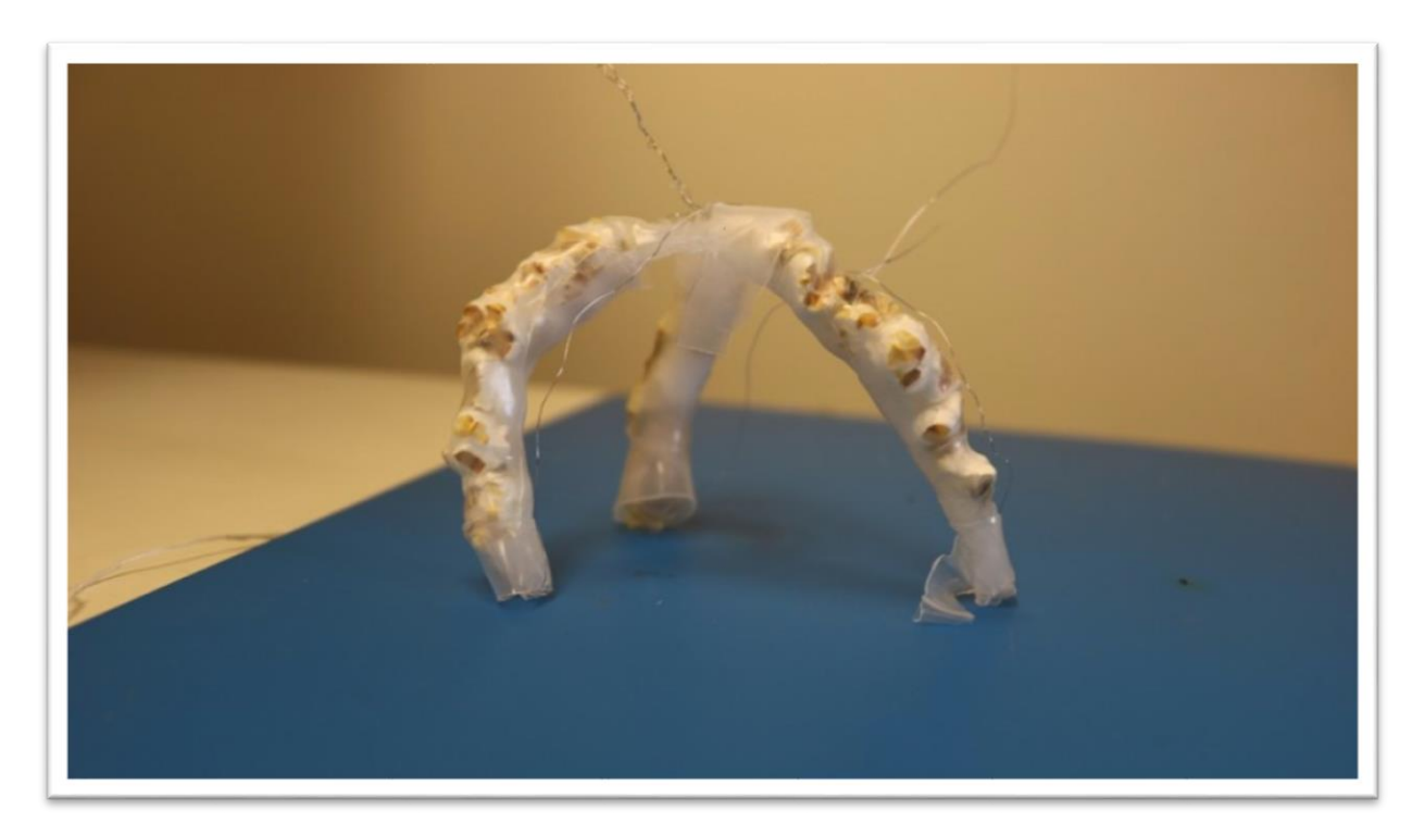
Fig 2.A soft robotic device powered by popcorn, constructed by researches in Cornell's Collective Embodied Intelligence Lab.

Summary: Researchers have discovered how to power simple robots with a novel substance that, when heated, can expand more than 10 times in size, change its viscosity by a factor of 10 and transition from regular to highly irregular granules with surprising force. You can also eat it with a little butter and salt.